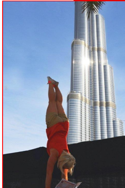
Where in the world is the Newsletter being read? Answer on back page.