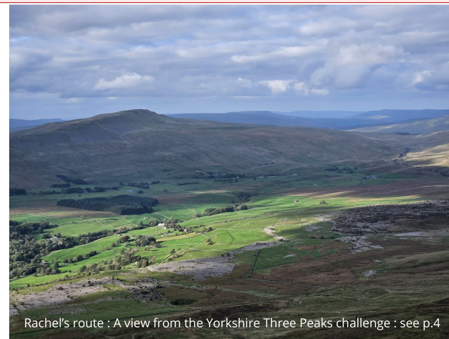
Rachel's route : A view from the Yorkshire Three Peaks challenge : see p.4