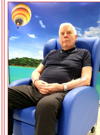
A patient tries out one of the radial lounge chairs

We have been given the opportunity to see them being used, so wanted to showcase their effective use. It is your donations and generosity that have enabled us to purchase these items, together with many others, to benefit patients finding themselves in hospital at Wythenshawe.