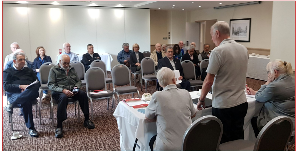
Annual General Meeting of the Club at the Cresta Court Hotel, Altrincham

The Chair is personally looking forward in this coming year to taking the Club into what could be a brighter future as we have now consolidated our position back in the Hospital and can only grow [continued on p.2]